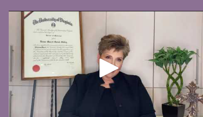
Vaccines Part 2