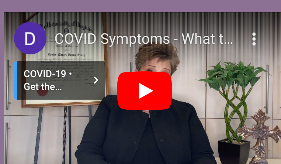
COVID Symptoms - What to Do