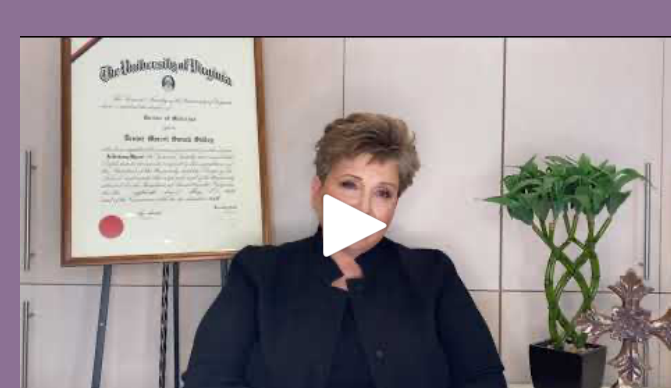
The Truth About Masks