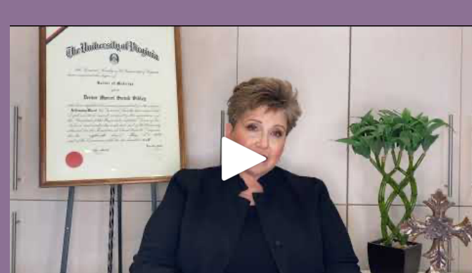
Ivermectin &amp; Steroids