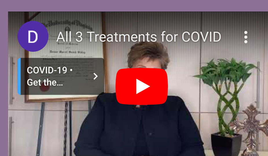
All 3 Treatments for COVID