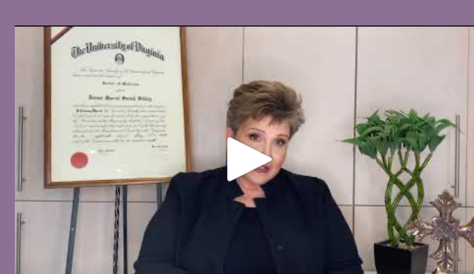
Vaccines Part 1